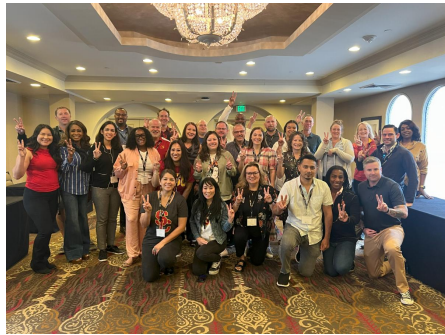
OCL Cohort 30 - Immersion I

This fall semester, we welcomed OCL Cohort 30 for Immersion I and Cohort 26 for Immersion II at the USC University Park Campus.