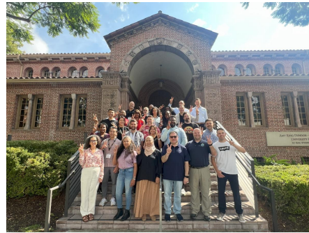
OCL Cohort 26 - Immersion II